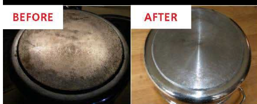
Before & after treatment with Innosoft B570